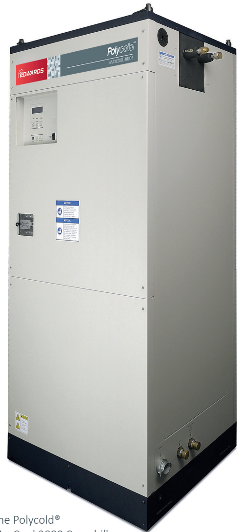
The Polycold® MaxCool 2000 Cryochiller is compliant with European Application Refrigerants (EC 1005/2009) and the US EPA SNAP

MaxCool Cryochillers are the most cost-effective upgrade that you can add to any diffusion-pumped, turbo-pumped, or helium-cryopumped system.